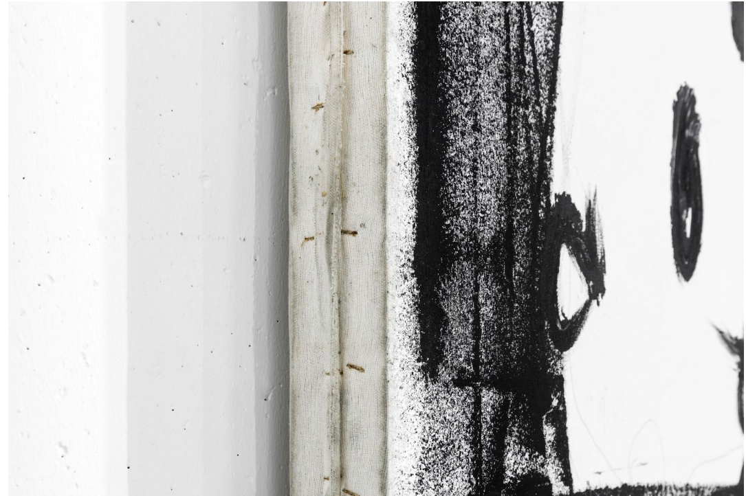
Gesture memorization exercise. Paintings made in 1 minute from sketches made beforehand.