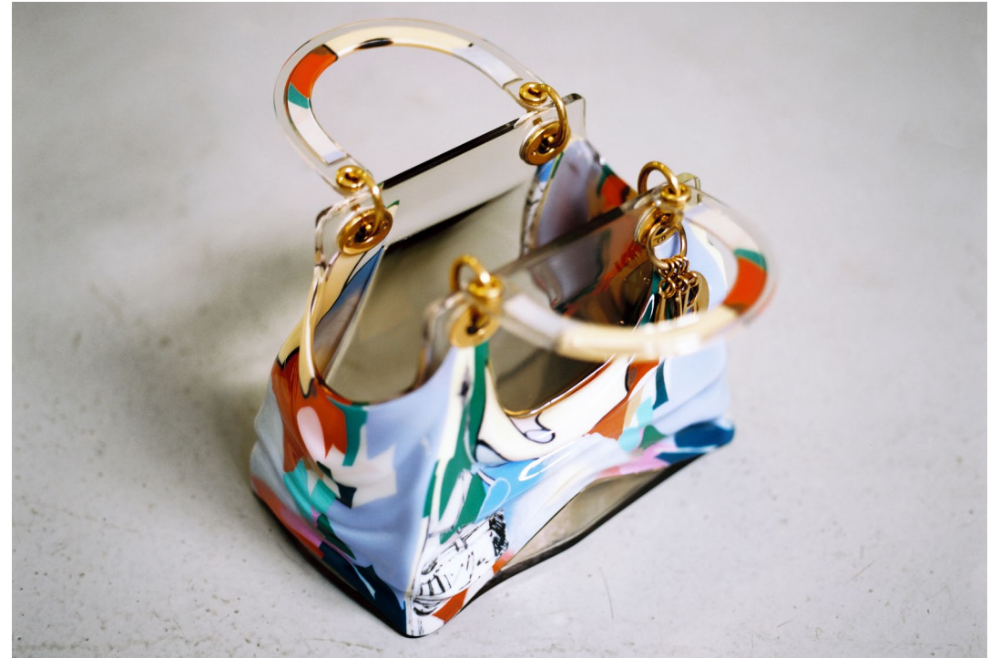
Collaboration project with Dior on the reinterpretation of the iconic Lady Dior bag. Limited Edition of 100 copies.